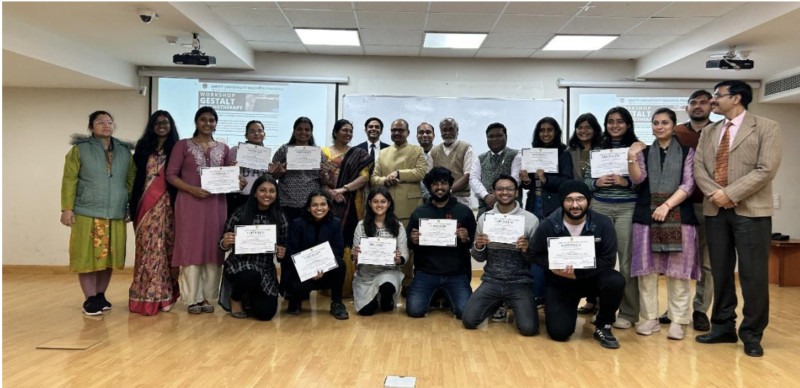
(Certificate distribution ceremony to our guests and students and faculty of AIBAS)